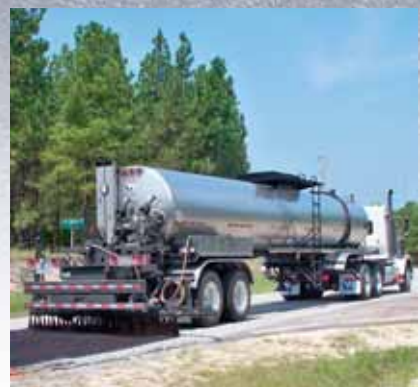
CUSTOM BUILT TANK SIZES