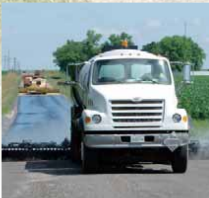
FULL CAB CONTROL

The total package – capable and dependable, the Etnyre Centennial Series asphalt distributor is built to stay solidly on the job year after year.