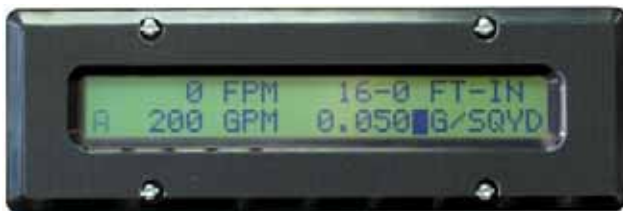
Computer screen displays information simultaneously