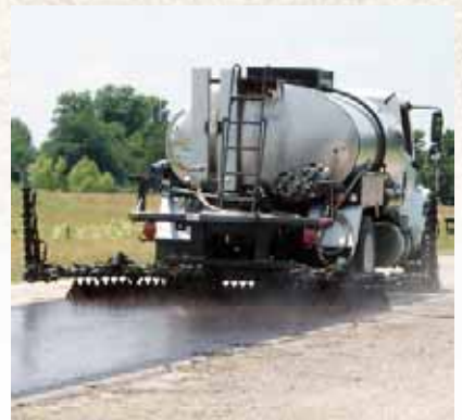
FASTER HEATING FASTER STARTS