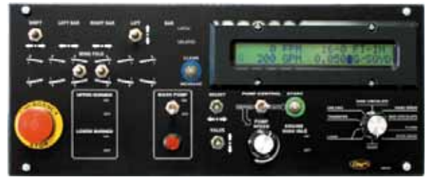
Rear control panel (shown with optional display).