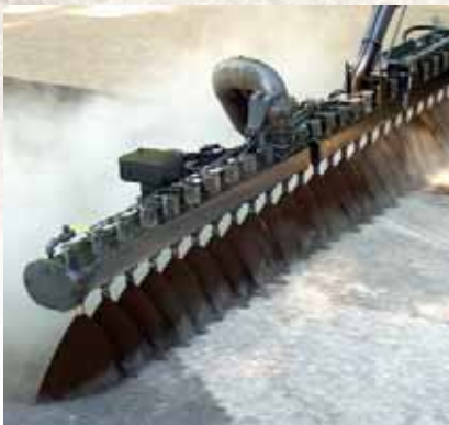
SOLID PIPE CIRCULATING SYSTEM