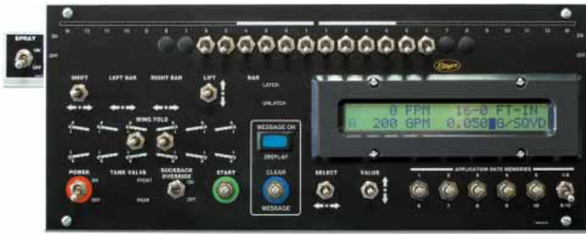
Control panel with computerized application rate control and spray controlled in 1' increments.

Combining individual spray bar controls with the application rate computer provides time saving variable width capabilities with the flick of a switch from the cab.